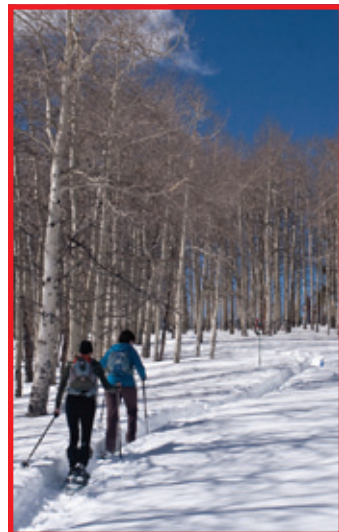
GRANITE GEAR/ART BY SNOWSHOE COMPANY

Bayfield Regional Conservancy 715/779-5263 www.brcland.org www.brcland.org The Brownstone Trail - 4.5 miles round trip. Easy walk that skirts Lake Superior shoreline. The Big Ravine Trail - 1.8 miles round trip. Hike along the steep rim of the Big Ravine among old-growth hemlocks. Iron Bridge Trail - 3/4 mile round trip. Follow the ravine creek under the "Iron Bridge" to an overlook.